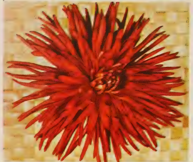
APACHE. 75c each; 3 for $2.00